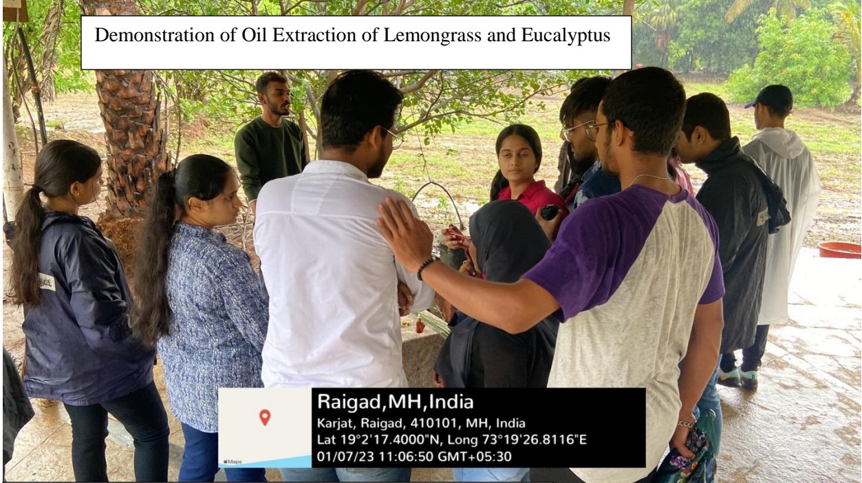
Demonstration of Oil Extraction of Lemongrass and Eucalyptus