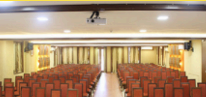
Mohini Hiro Punwani Auditorium