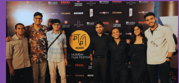
Student short film screened at Jio MAMI Film Festival in 2024