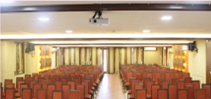
Mohini Hiro Punwani Auditorium

The department has given me more than just a degree, it's given me a direction. My time at KC has truly been instrumental in shaping my perspective, honing my media acumen and nurturing the curiosity - all of which continue to shape my career every day.