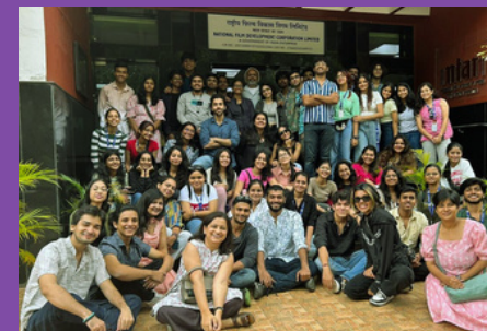
Student visit to National Film Archives of India at Pune to understand film conservation