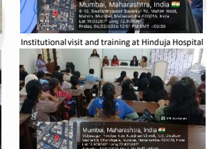
Institutional visit and training at Hinduja Hospital