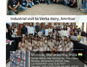
Industrial visit to Verka dairy, Amritsar