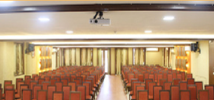
Mohini Hiro Punwani Auditorium